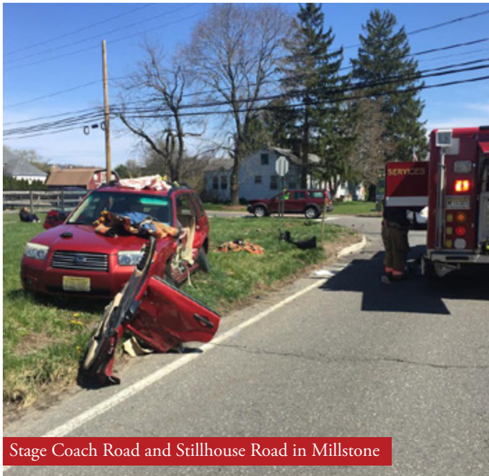
Stage Coach Road and Stillhouse Road in Millstone