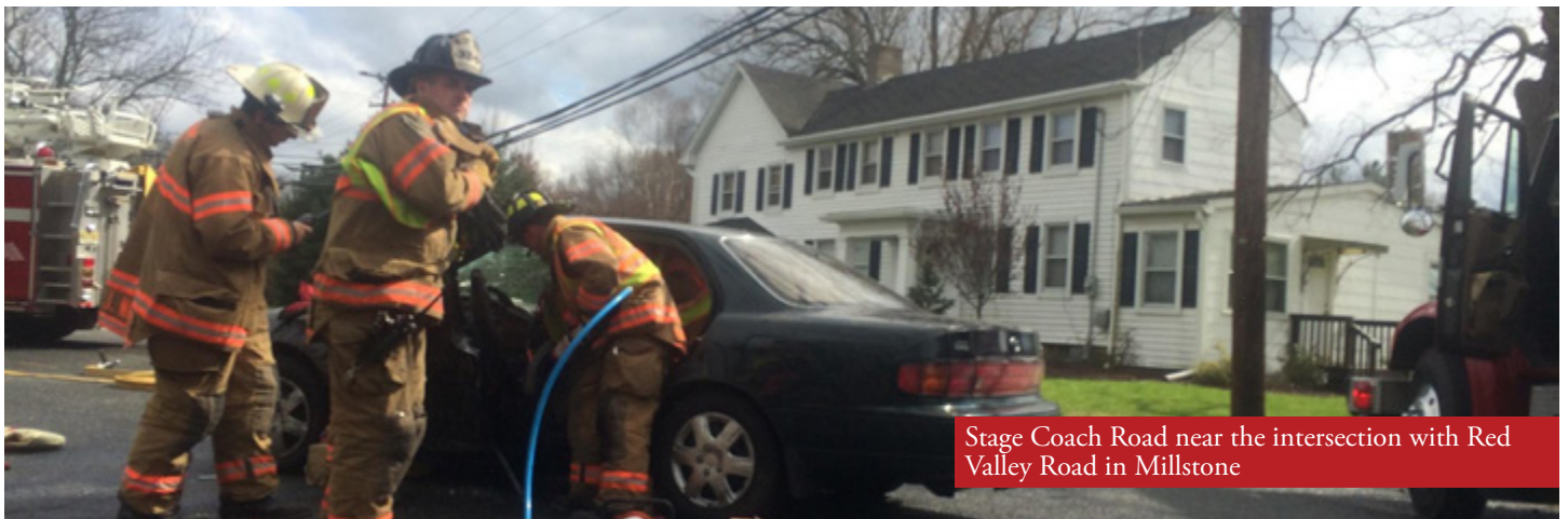
Stage Coach Road near the intersection with Red Valley Road in Millstone

Registered voters may apply to vote by mail for any reason. Applications can be picked up at the County Clerk's office or found at www.monmouthcountylvotes.com . Applications must be received by mail one week prior to the election. Voters may also apply in person at the County Clerk's office up until 3 p.m. the day before the election.